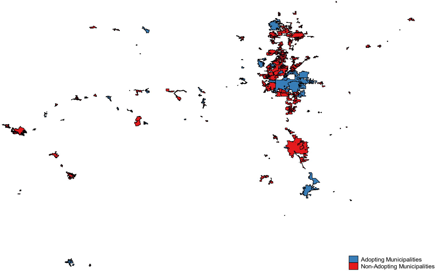
Figure 1. Map of Municipalities that Adopt Retail Marijuana Laws and Municipalities that Do Not